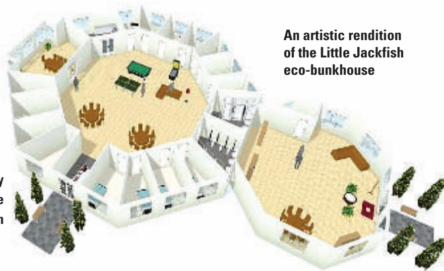
An artistic rendition of the Little Jackfish eco-bunkhouse

TEAM students assessed the feasibility of constructing a work centre that balances economic, environmental and Aboriginal cultural design factors. These considerations support OPG's commitment to reduce its carbon footprint and make future corporate facilities more environmentally friendly. Aboriginal cultural considerations seek to better integrate the proposed work centre in the traditional territory of the Lake Nipigon First Nation.